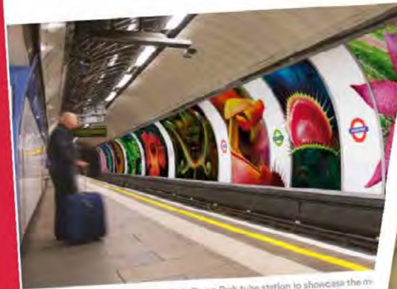
BBC Creative has transformed London's Green Park tube station to showcase the world of plants

To mark the launch of Sir David Attenborough's latest series The Green Planet, BBC Creative has transformed London's Green Park tube station into a vivid experience that celebrates the magical world of plants.