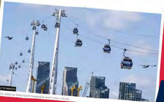
The cable car links North Greenwich and Custom House